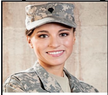
If you are currently on active duty, serving the United States honorably, anywhere in the world, or have served honorably during any of the eligible war eras, we invite you to become a member of The American Legion.