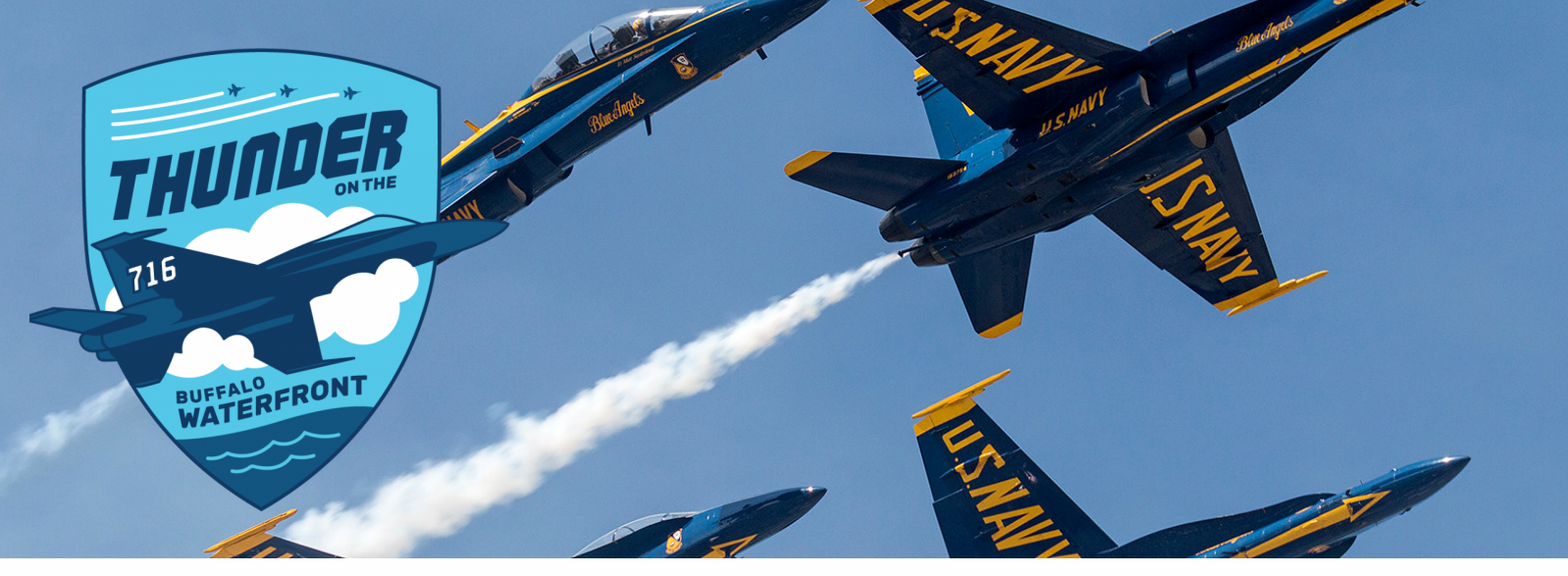
Blue Angels air show coming to Buffalo's Outer Harbor By MIKE DESMOND